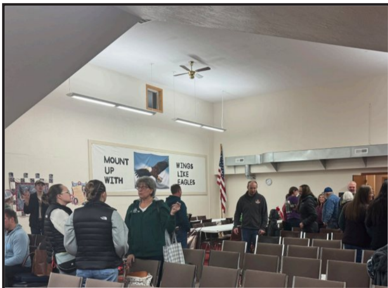
All kinds of good fellowship and conversations following Wednesday evening assembly Christ's Church in Great Falls

“Grace to you and peace from God our Father and the Lord Jesus Christ, who gave Himself for our sins so that He might rescue us from this present evil age, according to the will of our God and Father, to whom be the glory forevermore. Amen. ”