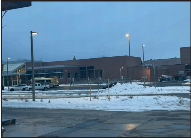
The Strand Union Building (the SUB) where many Bible studies with college students have been held Montana State University campus Bozeman, MT

“And to Him was given dominion, Glory and a kingdom, That all the peoples, nations and men of every language Might serve Him. ” --- Daniel 7:14a