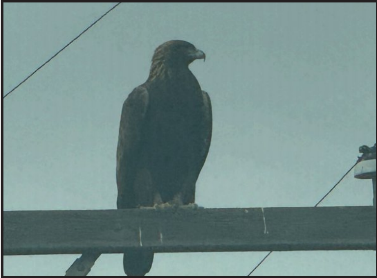
Part of the “neighborhood watch program” Golden eagle on Pennwell Bridge Road North of the church building Christ’s Church in Bozeman

“I planted, Apollos watered, but God was causing the growth. So then neither the one who plants nor the one who waters is anything, but God who causes the growth. Now he who plants and he who waters are one; but each will receive his own reward according to his own labor.”