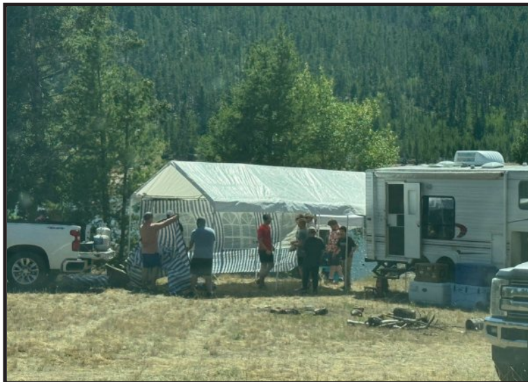
Guys from Billings getting the cook tent set up Men's Peaks 2025 Delmoe Reservoir, near Butte, MT

“I will feed your oppressors with their own flesh, And they will become drunk with their own blood as with sweet wine; And all flesh will know that I, the LORD, am your Savior And your Redeemer, the Mighty One of Jacob.” -- Isaiah 49:26