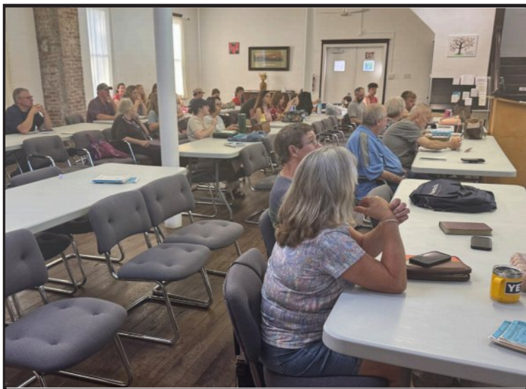
Some of the evening assembly Mahoning Valley Church of Christ in their new building near Salem, OH

“Grace to you and peace from God our Father and the Lord Jesus Christ, who gave Himself for our sins so that He might rescue us from this present evil age, according to the will of our God and Father, to whom be the glory forevermore. Amen.”