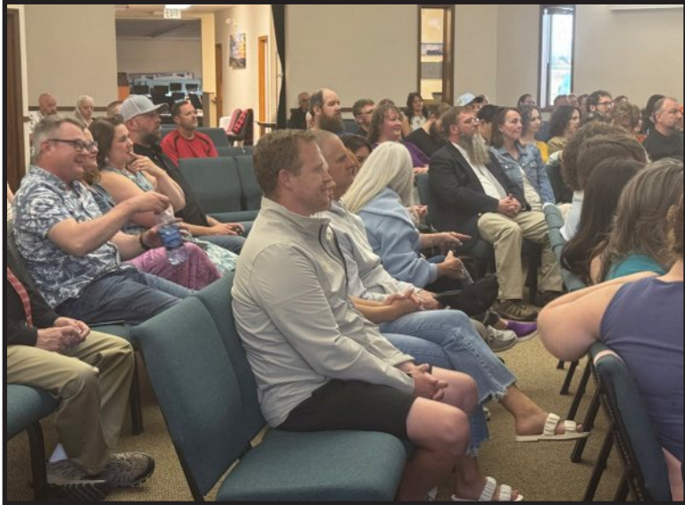
Some of the crowd gathered for the 48th annual Awards and Graduation ceremony - 2025 Bozeman Christian School an integral ministry of Christ's Church in Bozeman, MT

"I have fought the good fight, I have finished the course, I have kept the faith; in the future there is laid up for me the crown of righteousness, which the Lord, the righteous Judge, will award to me on that day; and not only to me, but also to all who have loved His appearing. "