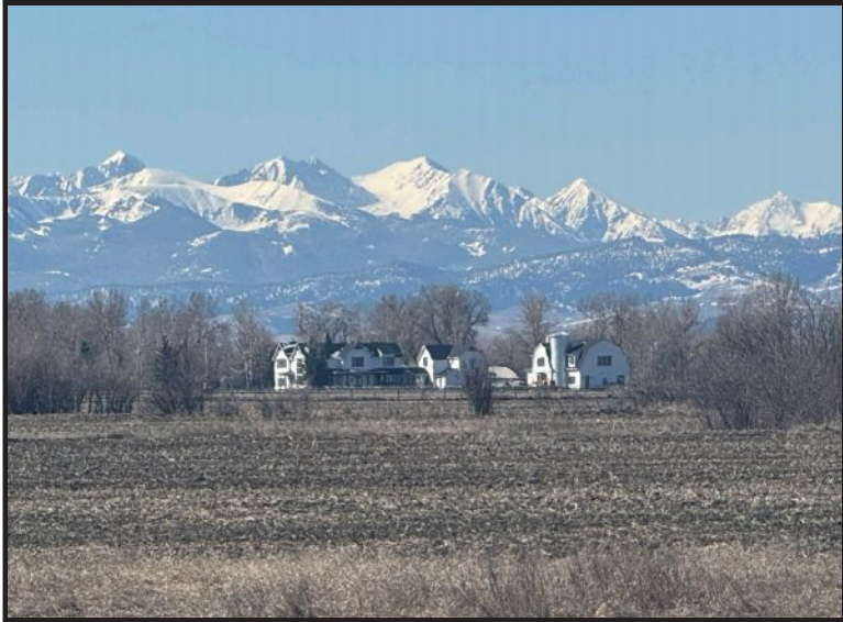
The “Spanish Peaks” of the Madison Range location of the early “Spanish Peaks Clinic” 1972 - about 1980

(Picture taken from Spain’s Bridge Road north of church building) Christ’ Church, Bozeman, MT