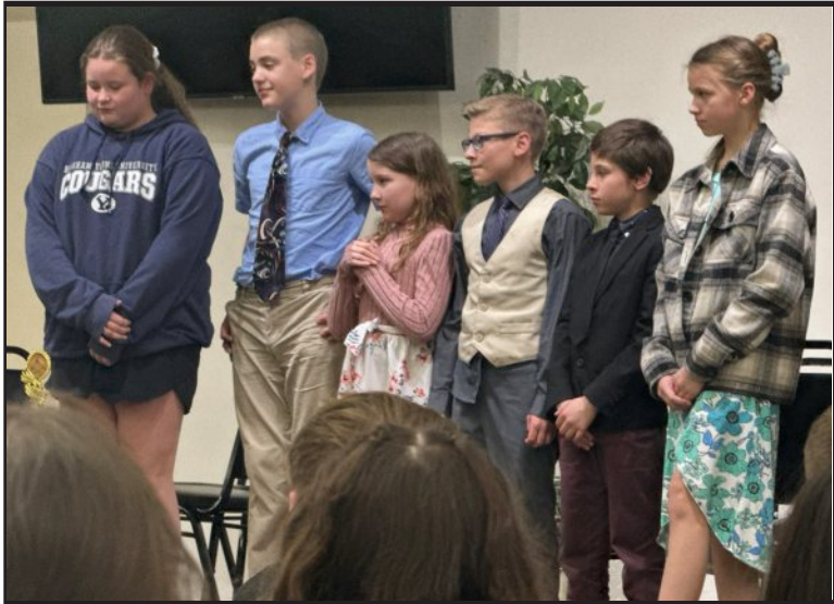
Winners of the youth division “spiritual leadership award” team from Great Falls Christ’s Church Academy an integral ministry of Christ’s Church in Great Falls

When He had said these things, He cried out with a loud voice, “Lazarus, come forth.” The man who had died came forth, bound hand and foot with wrappings, and his face was wrapped around with a cloth. Jesus *said to them, “Unbind him, and let him go.”