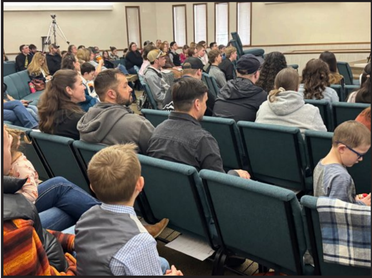
Some of the crowd at the opening Bible Bowl 2025 at the church building Christ's Church in Bozeman\ Bozeman, MT

“He rode upon a cherub and flew; And He sped upon the wings of the wind. He made darkness His hiding place, His canopy around Him, Darkness of waters, thick clouds of the skies.” -- Psalm 18:10,11