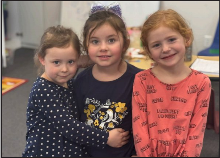
Young girls in the Learning to Read learning center Christ's Church Academy 48th St Church of Christ Billings, MT

“Behold, God is my salvation, I will trust and not be afraid; For the LORD GOD is my strength and song, And He has become my salvation.” -- Isaiah 12:2