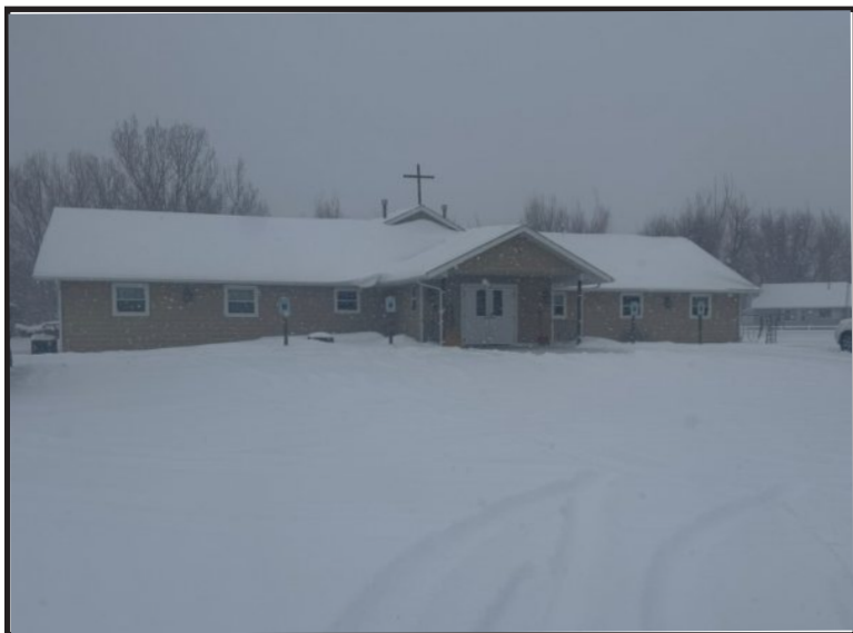
48th St. Church of Christ building housing the Christian school on a cold, snowy, February day Billings, MT

“GOD SAID TO MOSES, ‘I AM WHO I AM’ ... THIS IS MY NAME FOREVER, AND THIS IS MY MEMORIAL-NAME TO ALL GENERATIONS.” -- EXODUS 3:14,15