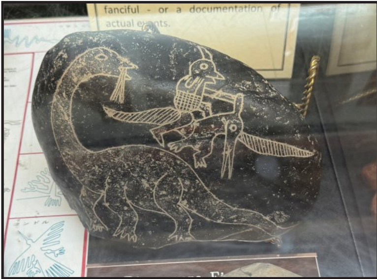
Pre-Inca burial stone from Peru dated about 1100 BC

People had the story of their lives carved on the burial stones Here is a clear picture of some dinosaurs, showing that some dinosaurs survived the Flood and were resident in South America from the Creation Museum, Glen Rose, TX