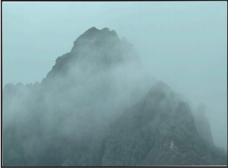
Eagle Rock in the Missouri River canyon between Helena and Great Falls, MT

Jesus “is coming in the clouds, and every eye will see Him, even those who pierced Him; and all the tribes of the earth will mourn over Him.”