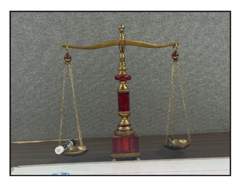
Work of school kids experiment in learning to live "a balanced life" Bozeman Christian School

"I will praise the LORD while I live; I will sing praises to my God while I have my being. Do not trust in princes, In mortal man, in whom there is no salvation." -- Psalm 146:2,3