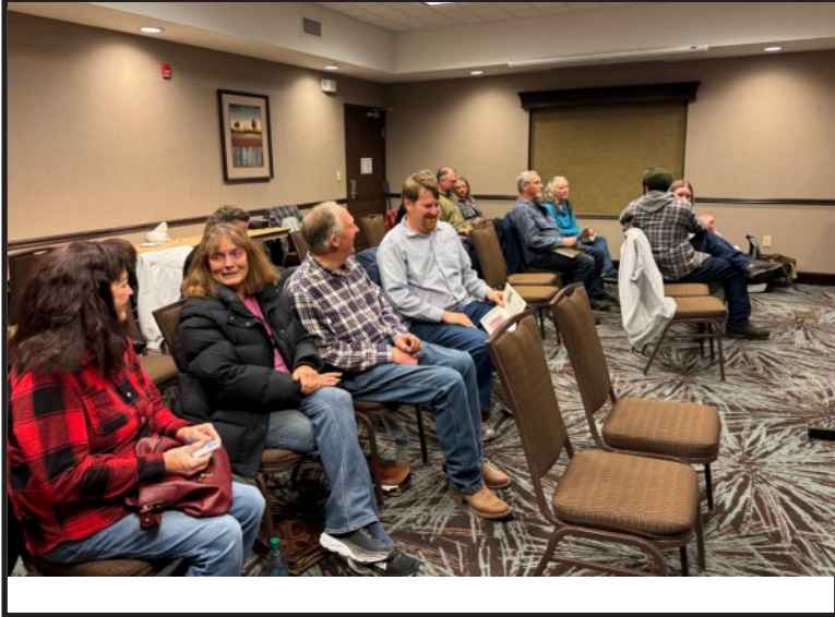
Brethren in Butte getting ready for assembly from 7:30-9:00 pm Christ's Church in Butte America

“In the exercise of His will He brought us forth by the word of truth, so that we would be a kind of first fruits among His creatures.”