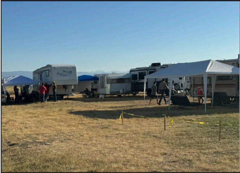
RV's being set up for Family Camp on the grounds of Christ's Church in Bozeman Family Camp 2024

“Come near to Me, listen to this: From the first I have not spoken in secret, From the time it took place, I was there. And now the Lord GOD has sent Me, and His Spirit.” -- Isaiah 48:16