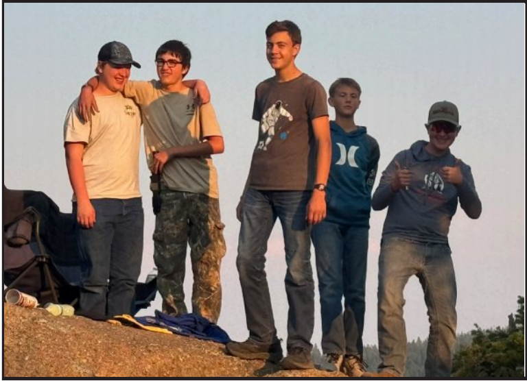
Lads from (mostly) Great Falls “Rockin’ it” from the top of an outcrop The men’s Peaks 2024 Delmoe Reservoir east of Butte, MT

“But I say to you, love your enemies and pray for those who persecute you, so that you may be sons of your Father who is in heaven; for He causes His sun to rise on the evil and the good, and sends rain on the righteous and the unrighteous.”