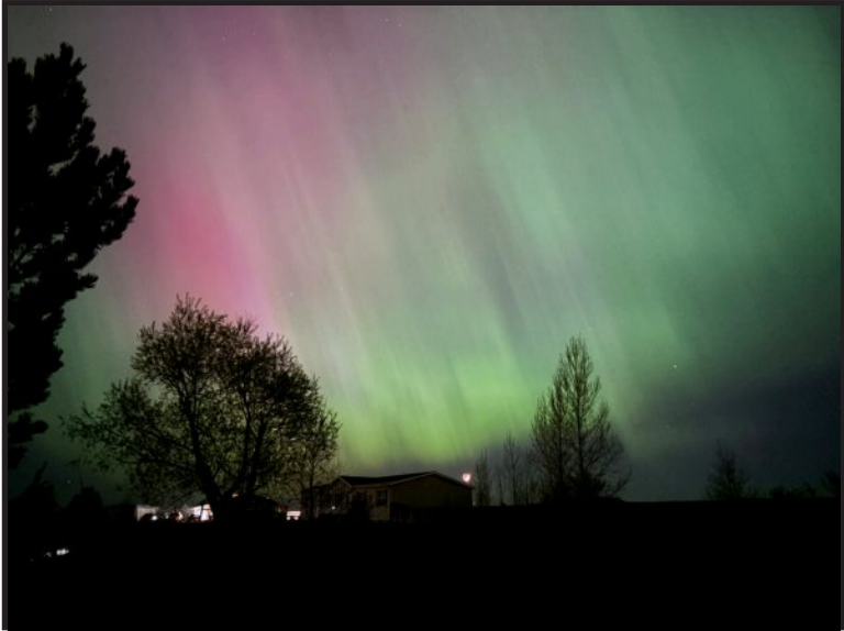
Colors from the Northern Lights May10, 2024, near Belgrade, MT

Of Israel, Balaam prophesied, “He couches, he lies down as a lion, And as a lion, who dares rouse him? Blessed is everyone who blesses you, And cursed is everyone who curses you.” -- Numbers 24:9