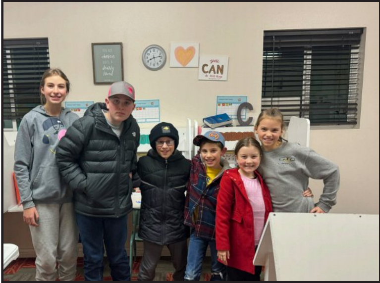
Kids from Great Falls Wed. night assembly Christ's Church in Great Falls Great Falls, MT

“Now for several days [Saul of Tarsus] was with the disciples who were at Damascus, and immediately he began to proclaim Jesus in the synagogues, saying, ‘He is the Son of God.’ ”