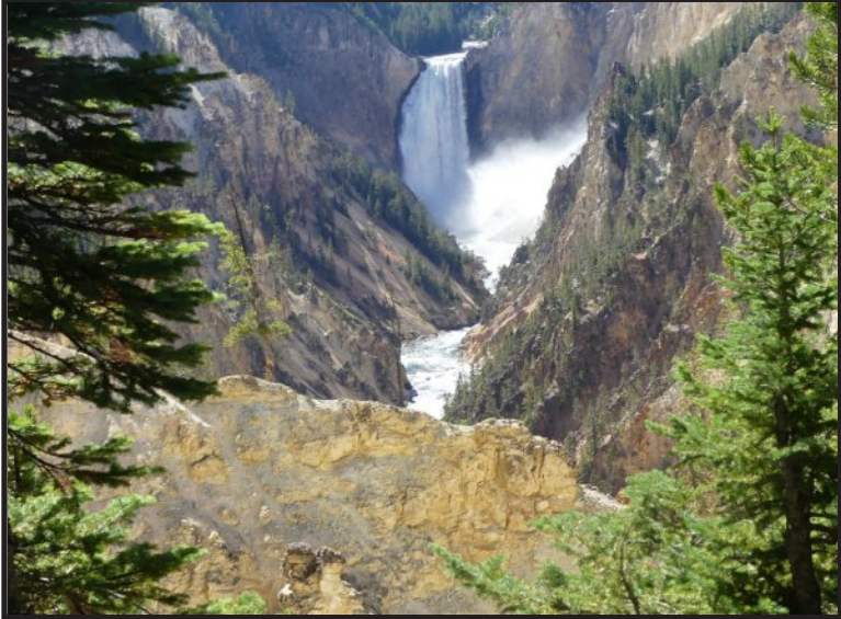
Lower Falls of the Yellowstone Yellowstone National Park

“If anyone does not love the Lord, he is to be accursed. Maranatha.”