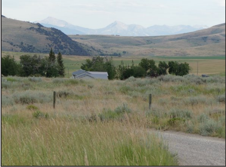
View of the Madison Range from the base of the Tobacco Root Mountains near Pony, MT

“For we know that if the earthly tent which is our house is torn down, we have a building from God, a house not made with hands, eternal in the heavens.”