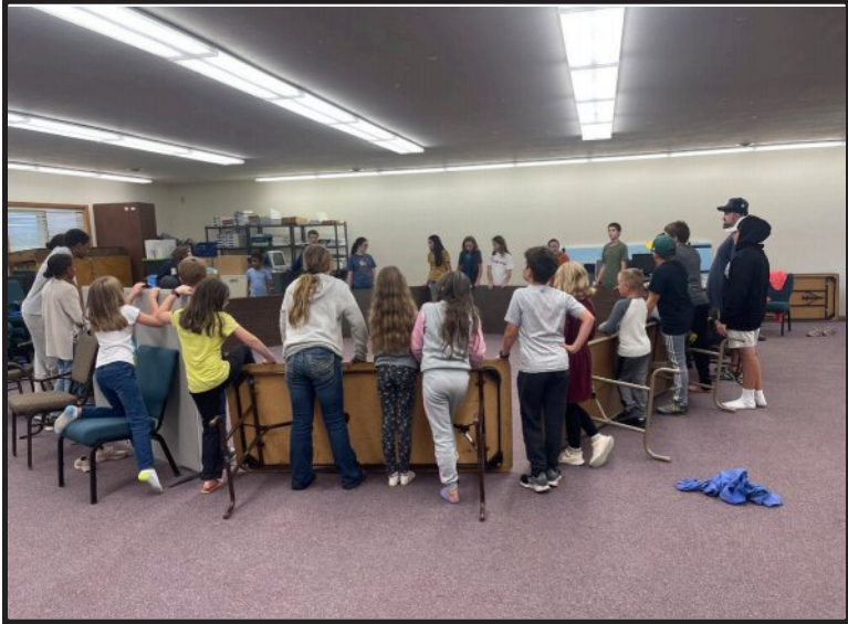
Young people playing a game of their invention inside the church building during the rain Family Camp'23 Christ's Church, Bozeman, MT

“And the peace of God, which surpasses all comprehension, will guard your hearts and your minds in Christ Jesus.”