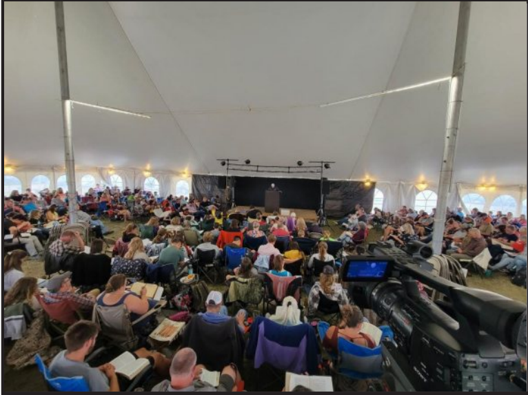
Photo of crowd under the big tent Family Camp '23 Christ's Church Bozeman, MT

“The glory of the LORD filled the house. The priests could not enter into the house of the LORD because the glory of the LORD filled the LORD’S house.” -- 2 Chronicles 7:1,2