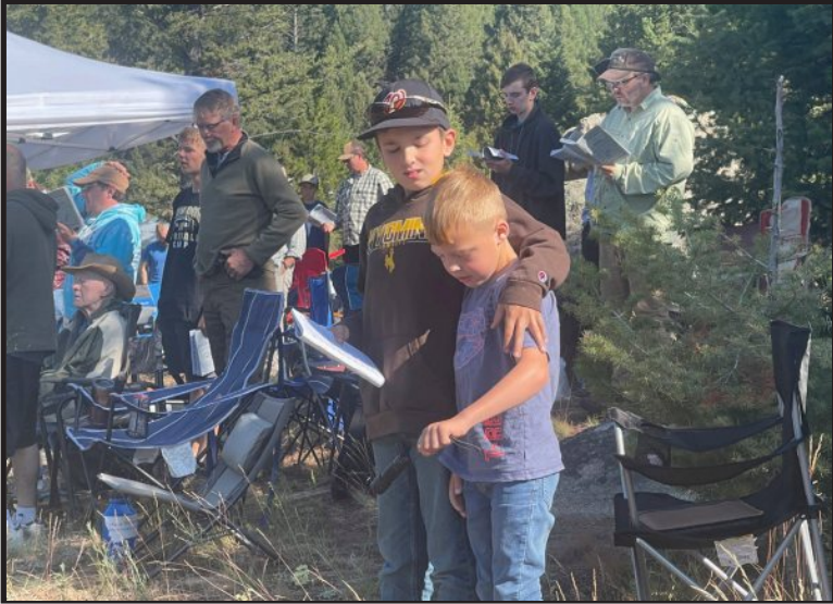
Older brother encouraging younger brother lads from Williston, ND 53rd annual men's Peaks Delmoe Reservoir

ABRAHAM CAME NEAR AND SAID, “WILL YOU INDEED SWEEP AWAY THE RIGHTEOUS WITH THE WICKED? SUPPOSE THERE ARE FIFTY RIGHTEOUS WITHIN THE CITY?” -- GENESIS 18:23,24A