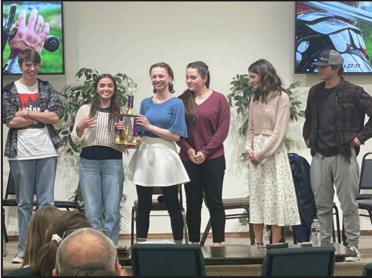
Bozeman team, winners of the senior division Bible Bowl 2023 Christ's Church Bozeman, MT

“You shall not take the name of the LORD your God in vain, for the LORD will not leave him unpunished who takes His name in vain. ” -- Deuteronomy 5:11