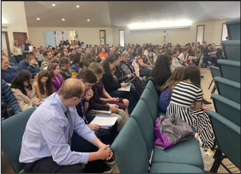
Some of the kids and the crowd 35+ years of Annual Bible Bowl Christ's Church in Bozeman

“FOR THE SOUL OF THE [SACRIFICIAL ANIMAL] IS IN THE BLOOD...FOR IT IS THE BLOOD BY REASON OF THE SOUL; THAT MAKES ATONEMENT.” -- LEVITICUS 17:11