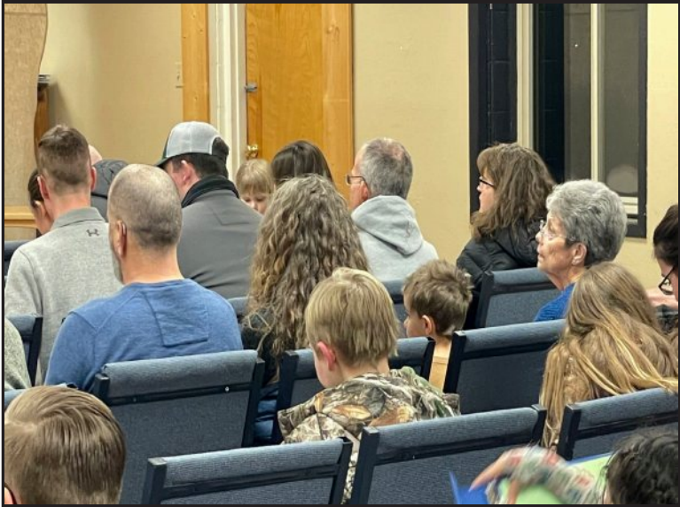
Some of the crowd at mid-week assembly Christ's Church in the Clark Fork Missoula, MT

“You shall not covet your neighbor’s wife, and you shall not desire your neighbor’s house...or anything that belongs to your neighbor.” -- Deuteronomy 5:21