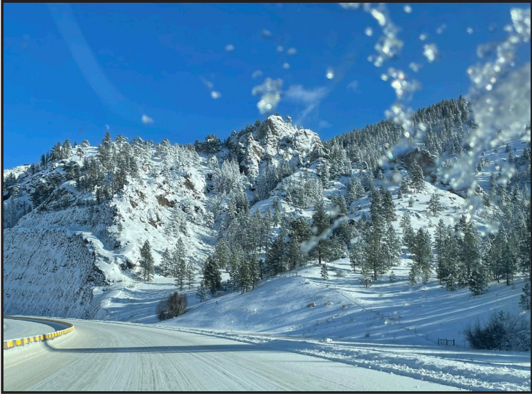
Solid ice and snow on I-15 Missouri River Canyon on the road to Great Falls, MT

“Behold, now is ‘the acceptable time,’ behold, now is ‘the day of salvation.’ ”