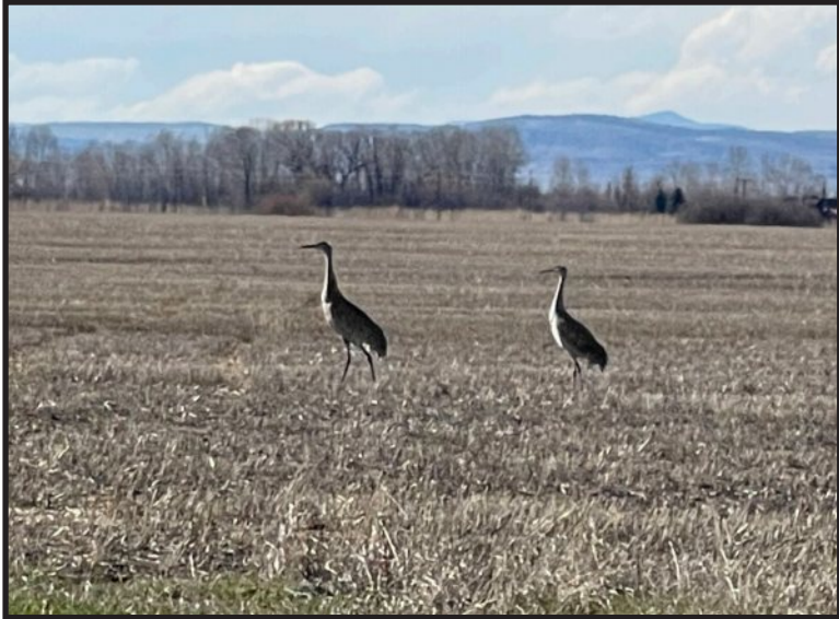
“Harbingers of Spring” Sandhill cranes Spain Bridge Road near the E. Gallatin River close to the church building Christ’s Church, Bozeman, MT

“...and I will make peace your administrators and righteousness your overseers” -- Isaiah 60:17