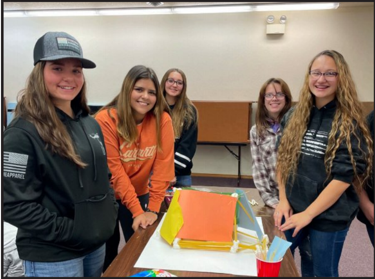
Girls participating in activities Spiritual Warriors' Weekend Christ' Church Bozeman, MT

DO NOT SLAY MY ENEMIES, LEST MY PEOPLE FORGET; INSTEAD SCATTER THEM BY YOUR POWER, AND BRING THEM DOWN, O LORD, OUR SHIELD