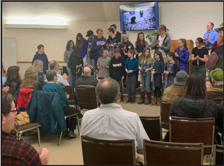
The young people who participated in the 2021 Bible Bowl Christ's Church Bozeman, MT

“They said therefore to the blind man again, ‘What do you say about Him, since He opened your eyes?’ And he said, ‘He is a prophet.’ ”