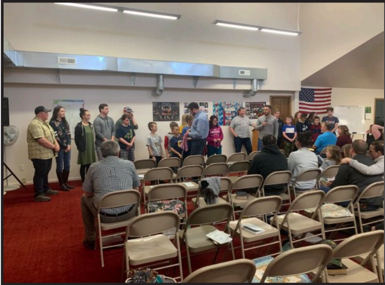
The young people who participated in the 2021 Bible Bowl Christ's Church Great Falls, MT

“Therefore some of the Pharisees were saying, ‘This man [Jesus] is not from God, because He does not keep the Sabbath.’ But others were saying, ‘How can a man who is a sinner perform such signs?’ And there was a division among them.”