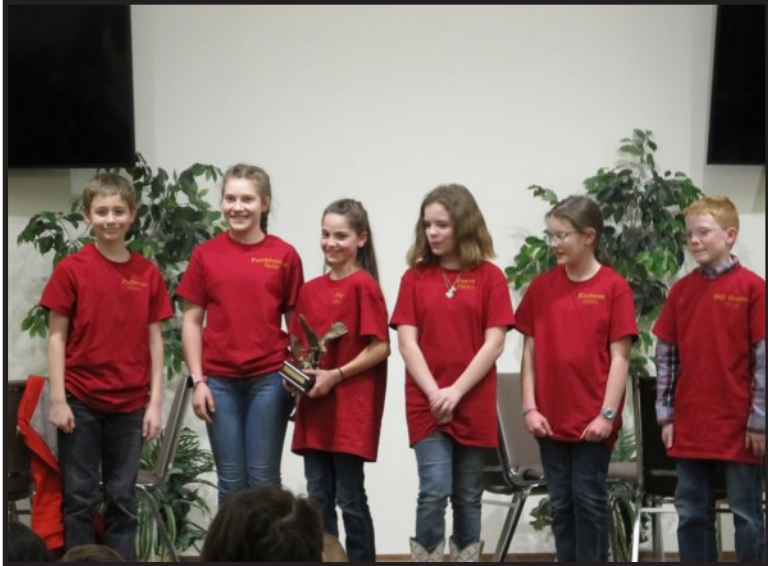
Youth division team "Fruits of the Spirit" from Bozeman winners of the spiritual award 2021 Bible Bowl at Christ's Church in Bozeman, MT

I will cry to God Most High, to God who accomplishes all things for me