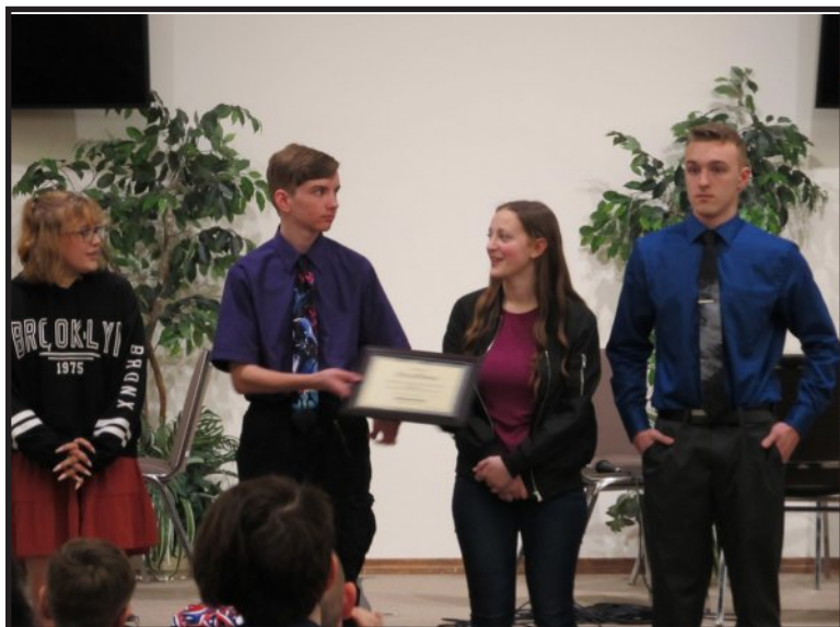
High school division team “Corinth, I am your Father”, from the 48th St. Church of Christ in Billings, MT 2021 Bible Bowl at Christ’s Church, Bozeman, MT

IN THE SHADOW OF YOUR WINGS I WILL TAKE REFUGE UNTIL DESTRUCTION PASSES BY