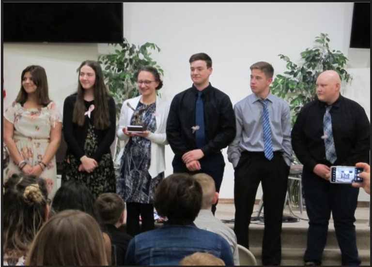
One of six teams from Great Falls, “Da Corint Peopo” winners of the spiritual award 2021 Bible Bowl at Christ’s Church in Bozeman

Be gracious to me, O God, be gracious to me, for my soul takes refuge in You