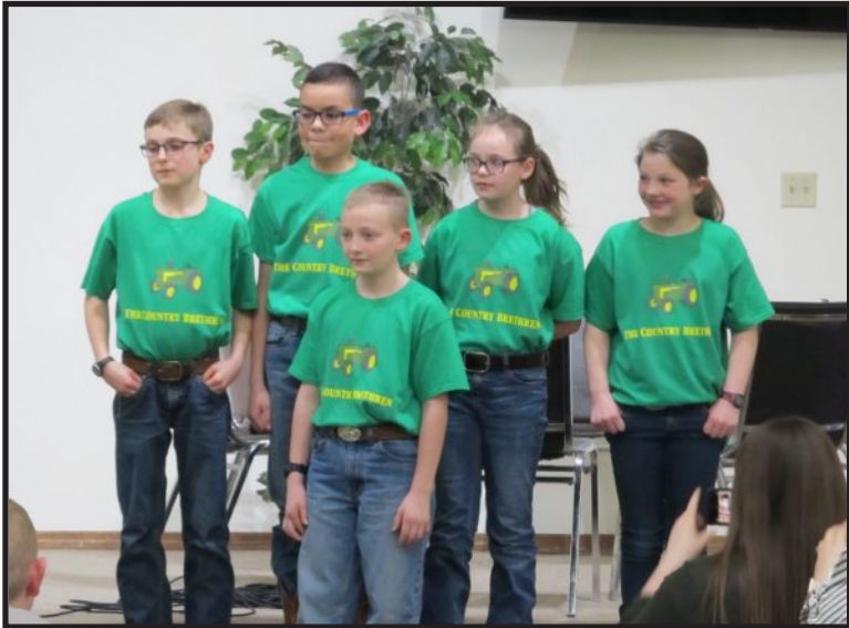
The "Country Brethren" team from Christ's Church in Missoula winners of the Youth Division 2021 Bible Bowl at Christ's Church in Bozeman, MT

YOU HAVE DELIVERED ME THAT I MAY WALK BEFORE GOD IN THE LIGHT OF THE LIVING