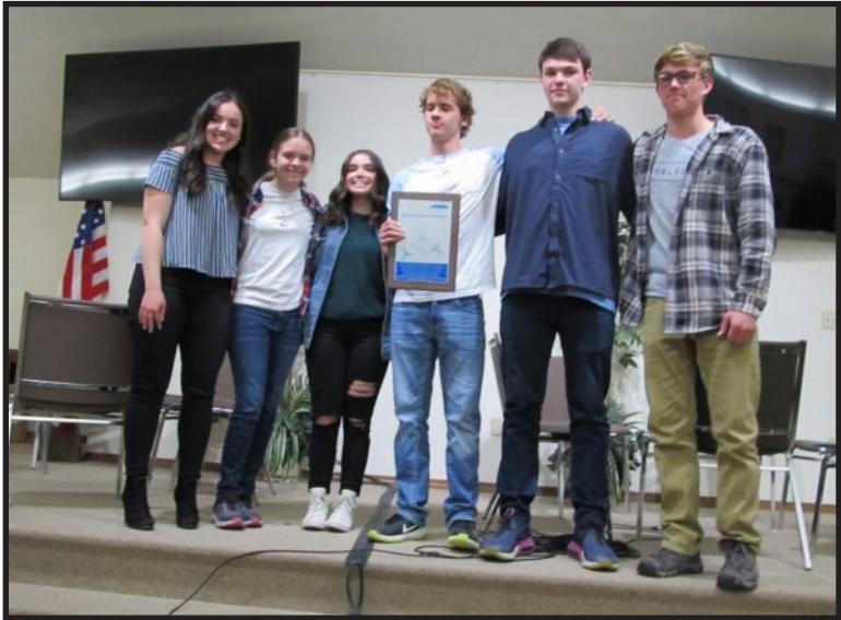
The "Pillsbury Doughboys" [unleavened] team from Christ's Church in Bozeman winners of the High School division 2021 Bible Bowl at Christ's Church in Bozeman, MT

YOU HAVE DELIVERED MY SOUL FROM DEATH, INDEED MY FEET FROM STUMBLING