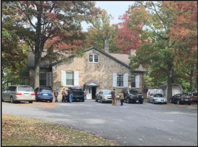
Location of the PA Family Camp Everett Legion Home hosted by Christ Church Bedford County Everett, PA

“[The devil] was a murderer from the beginning, and does not stand in the truth, because there is no truth in him. Whenever he speaks a lie, he speaks from his own nature; for he is a liar, and the father of lies.”