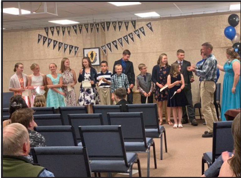
Awards and Graduation Ceremony Missoula Christian School Christ's Church in the Clark Fork Missoula, MT

“And He was saying to them [the Jews], ‘You are from below, I am from above; you are of this world, I am not of this world.’”