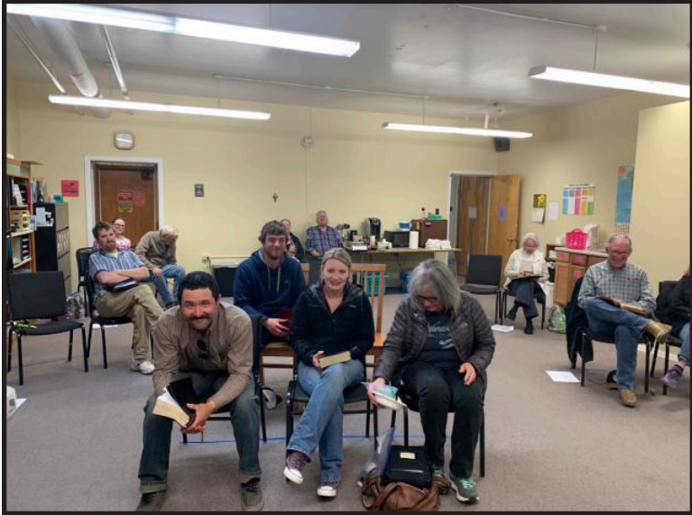
Some of the congregation in Butte on the first assembly during the coronavirus "lock down" Christ's Church in Butte, MT

"Even in your law it has been written, that the testimony of two men is true. I am He who bears witness of Myself, and the Father who sent Me bears witness of Me."