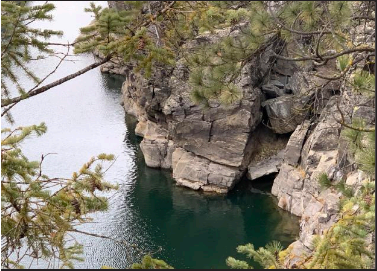
Old river channel and spillway Post Falls Dam on the Spokane River Post Falls, ID

You, as a wicked man, love evil more than good, falsehood more than speaking what is right