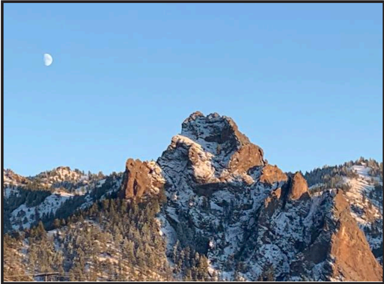
Eagle Rock, with the moon overseeing Missouri River Canyon between Helena and Great Falls, MT

“But this [rivers of living water] He spoke of the Spirit, whom those who believed in Him were to receive; for the Spirit was not yet given, because Jesus was not yet glorified.”