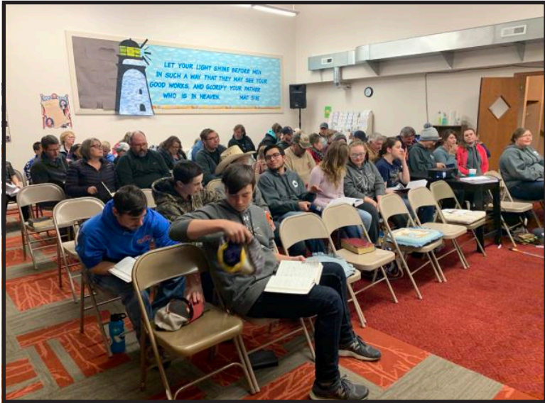
Some of the saints at Wed. evening assembly Christ's Church Great Falls, MT

“They were seeking therefore to seize Him; and no man laid his hand on Him, because His hour had not yet come.” John 7:30