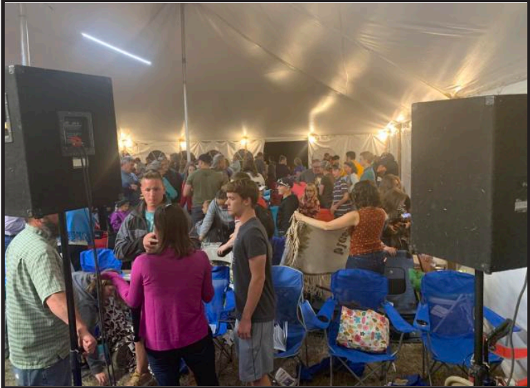
Some of the crowd inside the tent Family Camp 2019 Christ's Church, Bozeman, MT

Hide Your face from my sins, and blot out all my iniquities