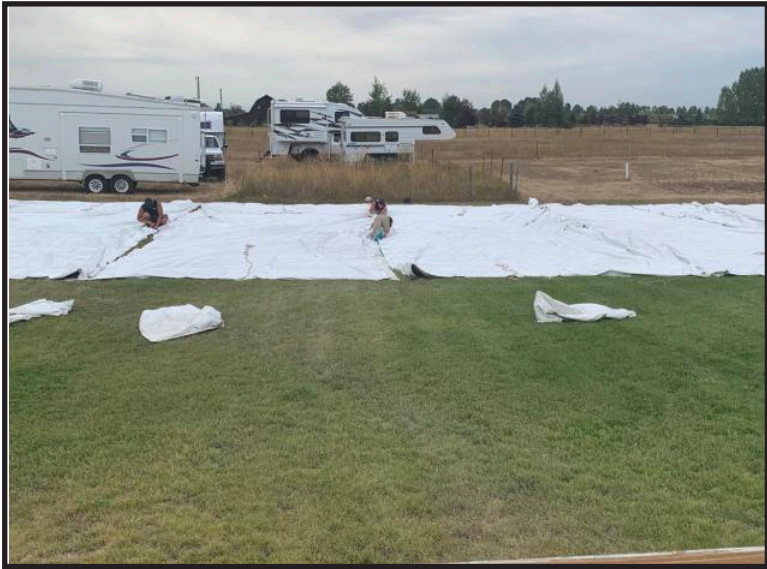
Crew from Party Time Plus of Billings putting up the tent Family Camp 2019 Christ's Church, Bozeman, MT

PURIFY ME WITH HYSSOP, AND I SHALL BE CLEAN; WASH ME AND I SHALL BE WHITER THAN SNOW