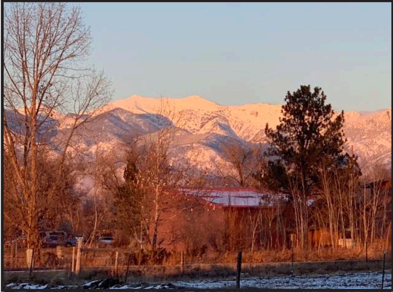
Fall view of the majestic Bridger Mountain Range seen from the church building Christ's Church in Bozeman, MT (artwork provided by God)

God will redeem my soul from the power of Sheol, for He will receive me