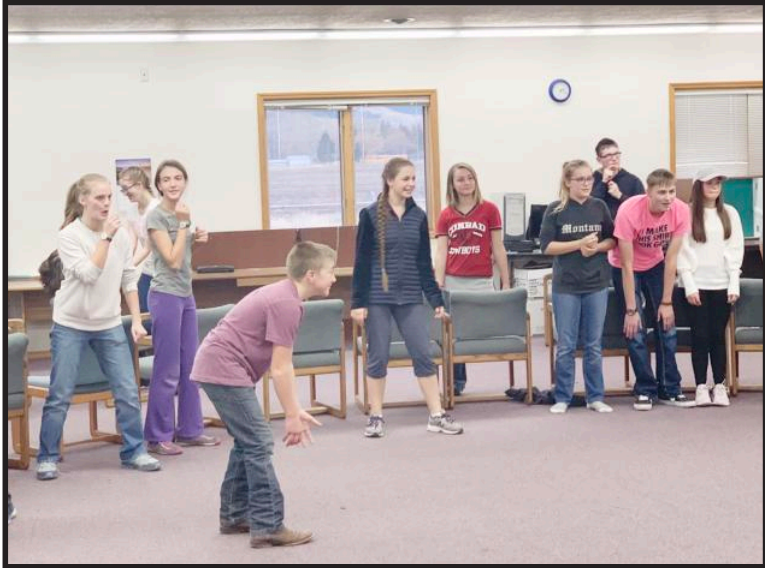
Young guys and gals from different congregations enjoying fellowship in some indoor games Spiritual Warriors' weekend Christ's Church in Bozeman, MT

They have called lands after their own names; but man in his pomp will not endure, like the beasts he will perish