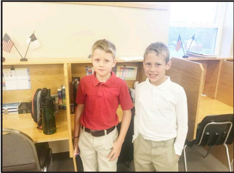
A couple of fine young lads students at the Lancaster, Ohio, Christian school Christ's Church of Fairfield

“Our fathers ate the manna in the wilderness; as it is written, ‘He gave them bread out of heaven to eat.’ ”