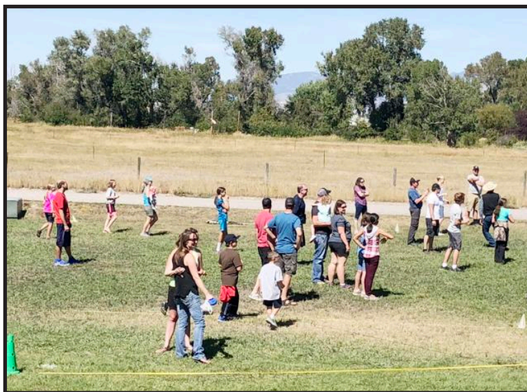
Spectators cheering on their respective volleyball teams Family Camp Olympics 2018 MT Family Camp on the grounds of Christ's Church in Bozeman, MT

“And when the multitudes found Him on the other side of the Sea of Galilee, they said to Him, ‘Rabbi, when did You get here?’ ”