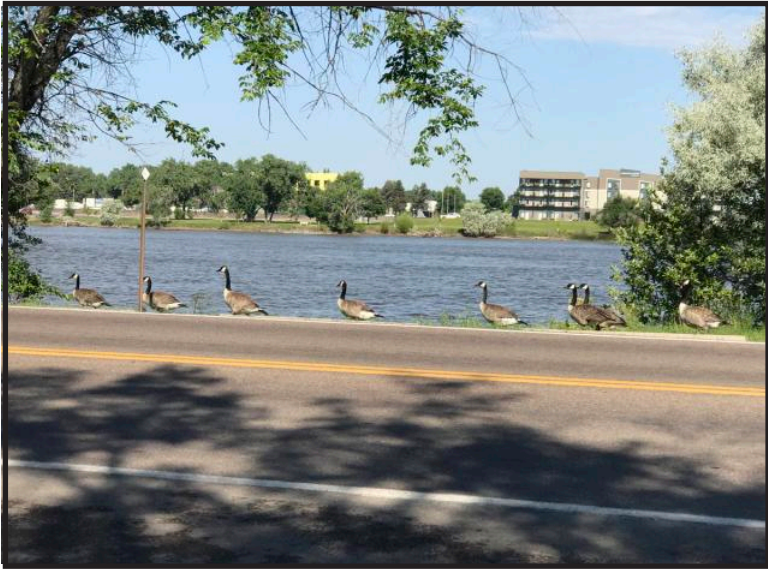
Geese making their way to the assembly along the Missouri River Great Falls, MT

“Jesus therefore perceiving that they were intending to come and take Him by force, to make Him king, withdrew again to the mountain by Himself alone.”